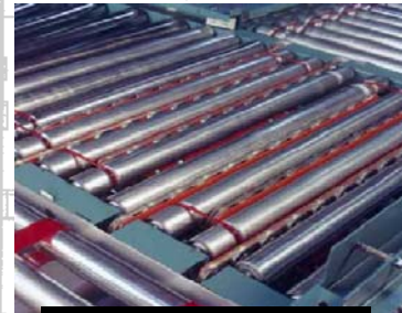
Pop-Up Belt Transfer

Precision Automation® has been providing Automation Solutions for industry since 1946. Our innovative designs optimize product flow and create an efficient system that successfully meets ever-changing demands. Precision's commitment to quality and service is only surpassed by our longevity and experience.