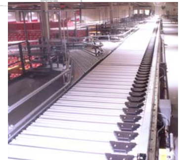
Sliding Shoe Sorter