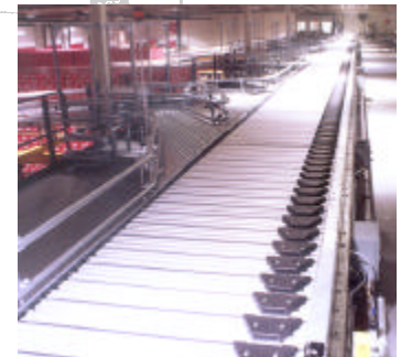
Sliding Shoe Sorter