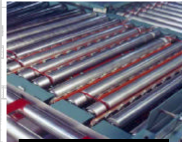
Pop-Up Belt Transfer

Precision Automation® has been providing Automation Solutions for industry since 1946. Our innovative designs optimize product flow and create an efficient system that successfully meets ever-changing demands. Precision's commitment to quality and service is only surpassed by our longevity and experience.